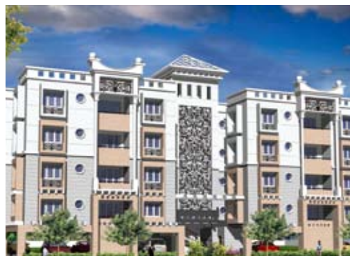
Sunshine, Saidapet, Chennai