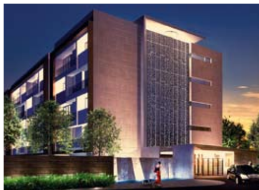
Anantya, OMR, Chennai

The vast experience of the Indus Directors in handling large projects with highly reputed companies and their impeccable management philosophy, contributes immensely to the company's prowess. The After-Sales Service by the inhouse Project Management staff, catering attentively to your every need, ensures your comfort, building and enduring relationship. Indus, thus marks an era of sustained development, construction and meaningful contribution towards a healthy, happy and wholesome quality of life.