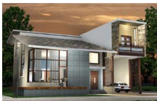
Riviera, OMR, Chennai