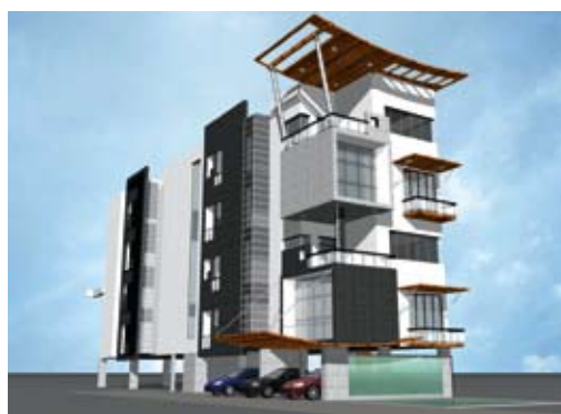
Nirvana, Venus Colony, Chennai