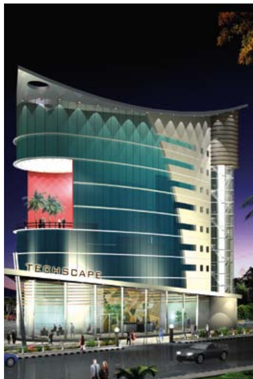
Techscape, OMR, Chennai