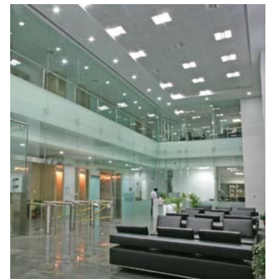
Computer Associate Campus, Hyderabad