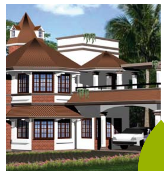
Sea Wind, Chennai